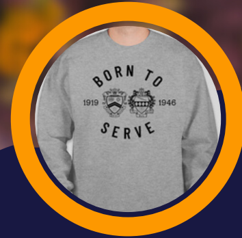
HANES SWEATSHIRT $30

(All Unisex - Light Steel) tinyurl.com/BornToServe22