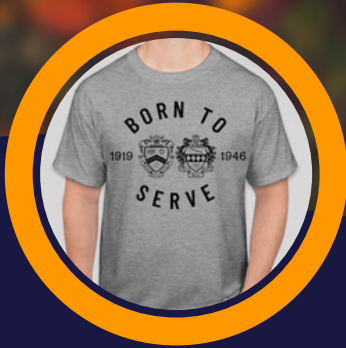
HANES SHORT SLEEVE $20