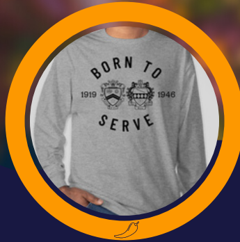
HANES LONG SLEEVE $25